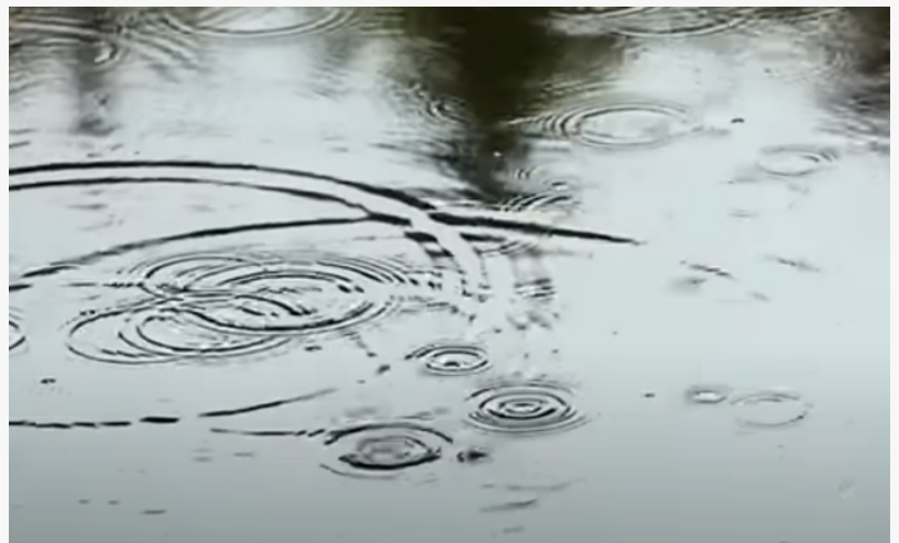
Cycling In The Rain