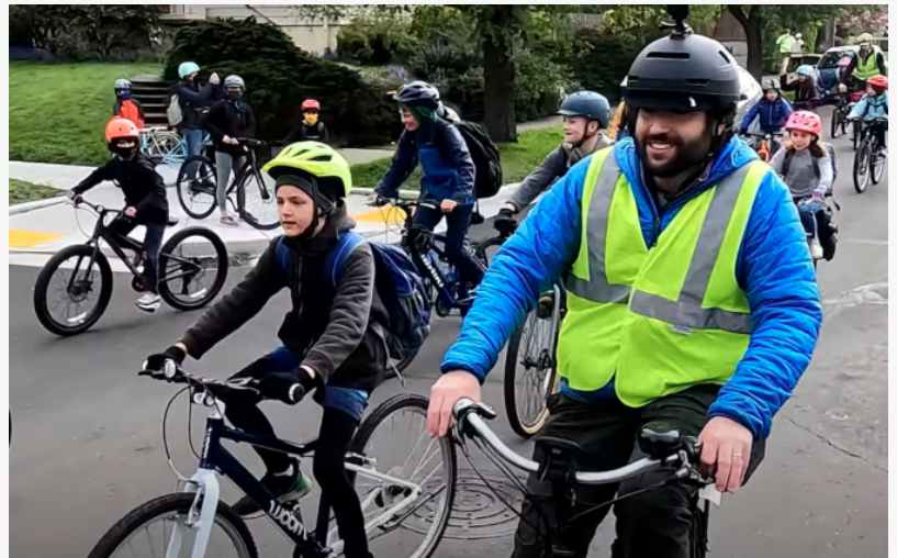
Cycling to school