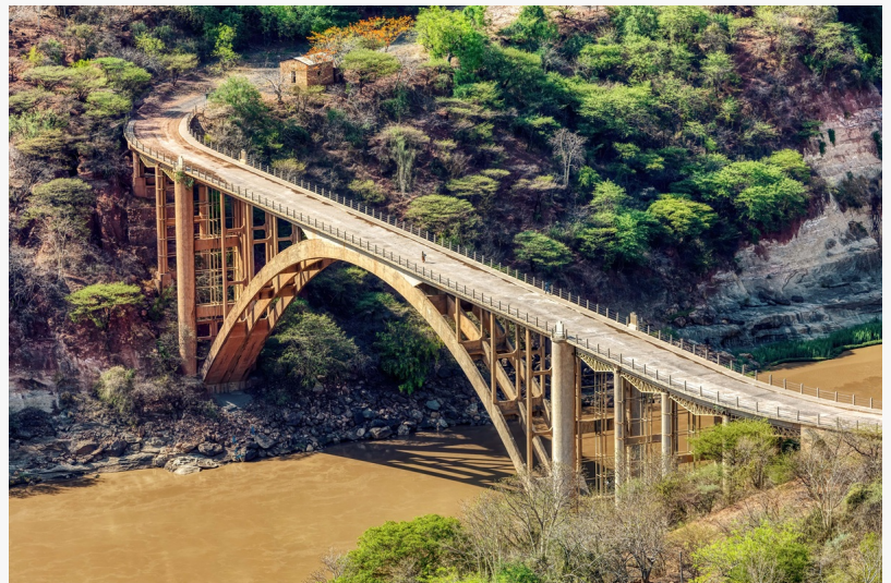
Bridge across river Blue Nile, Ethiopia