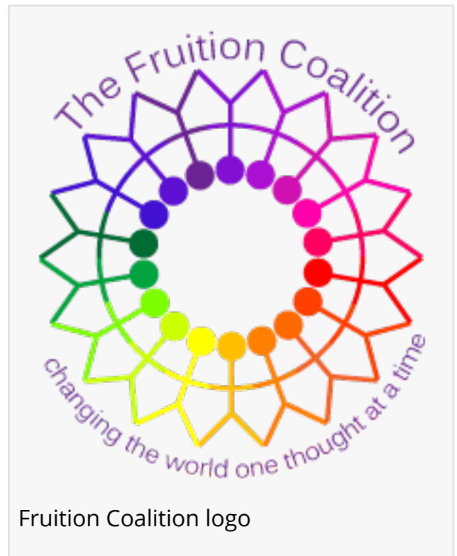
Fruition Coalition logo

This press release can be viewed online at: https://www.einpresswire.com/article/810286033