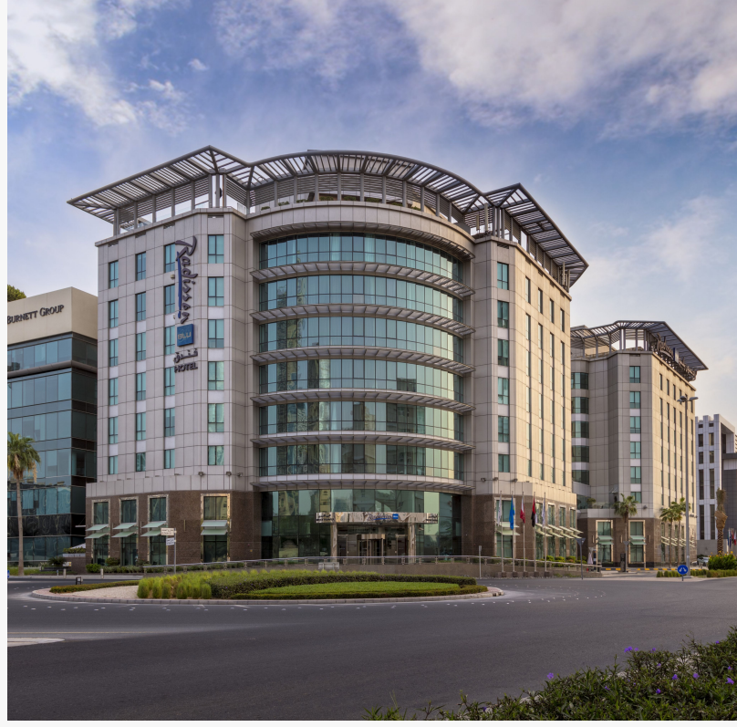
Radisson Blu Hotel Dubai Media City

DUBAI, DUBAI, UNITED ARAB EMIRATES, May 7, 2025 /EINPresswire.com/ -- In a significant step toward sustainability and environmental leadership, Radisson Blu Hotel, Dubai Media City, and Park Inn by Radisson, Dubai Motor City have proudly once again received the Green Key Certification from the Emirates Green Building Council. Further solidifying its commitment to sustainability, Park Inn by Radisson, Dubai Motor City has also been awarded the Dubai Sustainable Tourism Stamp for the second consecutive year.