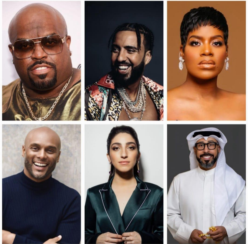
Why Oh Why musical American Artists