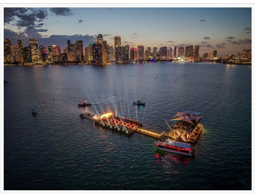
Newly unveiled modular platform developed for immersive events and experiential marketing activations.

The Vessel Miami features two decks, dual full-service bars, integrated A/V infrastructure, and a layout that supports fully customized floorplans. Event formats can range from weddings and corporate productions to fashion runways and brand activations.