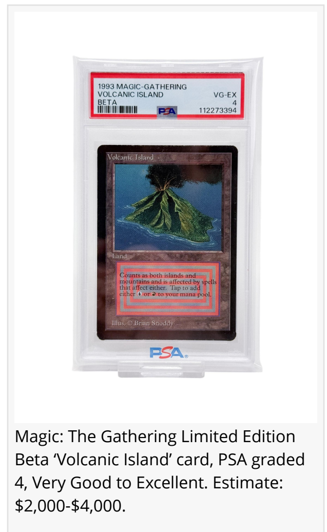
Magic: The Gathering Limited Edition Beta 'Volcanic Island' card, PSA graded 4, Very Good to Excellent. Estimate: $2,000-$4,000.