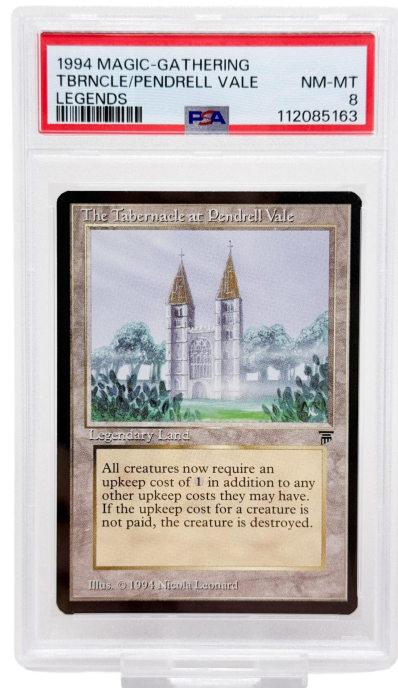
Magic: The Gathering Legends Expansion Set, 'The Tabernacle at Pendrell Vale' card, PSA graded 8.0 Near Mint. Estimate: $2,000-$4,000