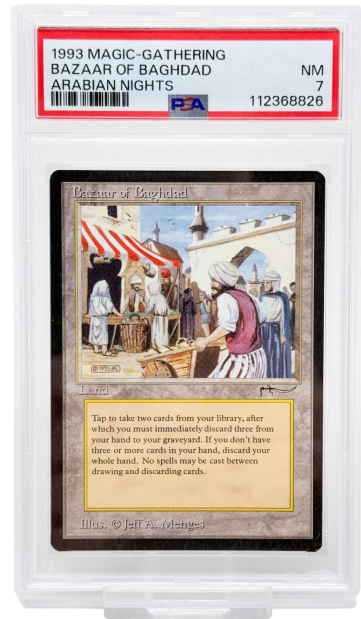
Magic: The Gathering Arabian Nights Expansion Set 'Bazaar of Baghdad' card, PSA graded 7 Near Mint. Estimate: $1,000- $2,000

This press release can be viewed online at: https://www.einpresswire.com/article/810406405 EIN Presswire's priority is source transparency. We do not allow opaque clients, and our editors try to be careful about weeding out false and misleading content. As a user, if you see something we have missed, please do bring it to our attention. Your help is welcome. EIN Presswire, Everyone's Internet News Presswire™, tries to define some of the boundaries that are reasonable in today's world. Please see our Editorial Guidelines for more information. © 1995-2025 Newsmatics Inc. All Right Reserved.