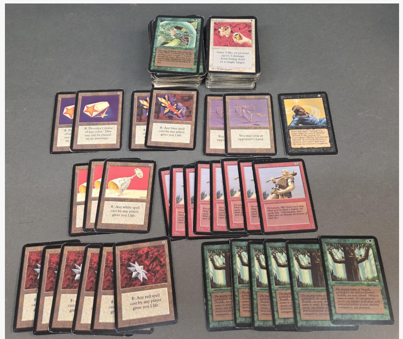
Collection of 252 Magic: The Gathering Limited Edition Alpha cards. Lot estimate: $3,000-$4,000