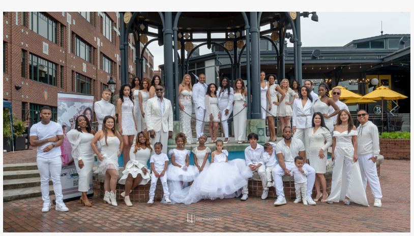
All White Waterfront Photo Shoot

Traffick & Walk the Runway 2.0 — The Uninterrupted All White Photo Shoot Campaign