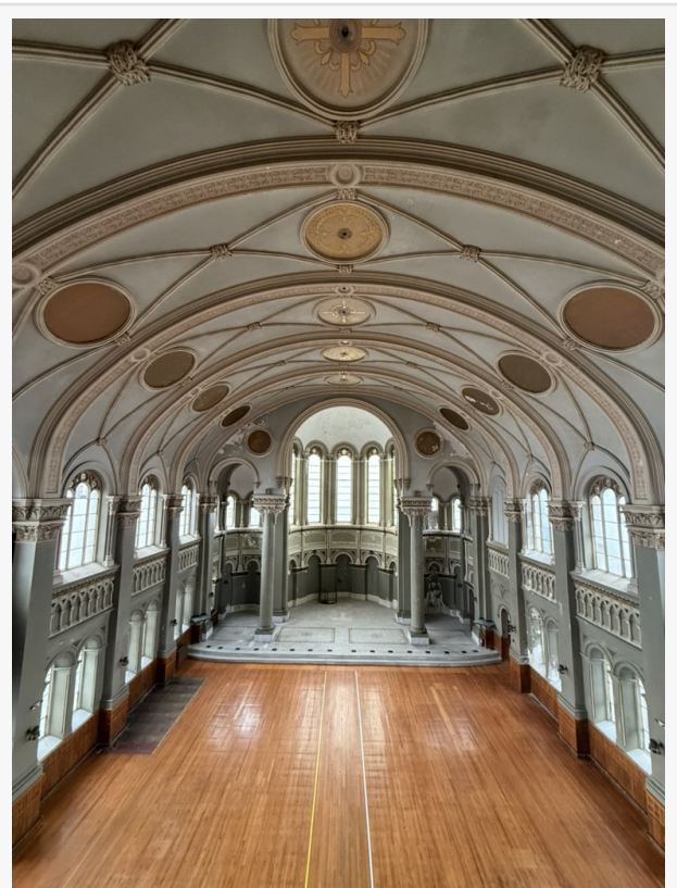
The interior of the Jack Kerouac Center

Once a place of worship, the church will become a sanctuary for creativity — an open environment where diverse artists, thinkers, and performers can experiment, push boundaries, and share their visions with the world.