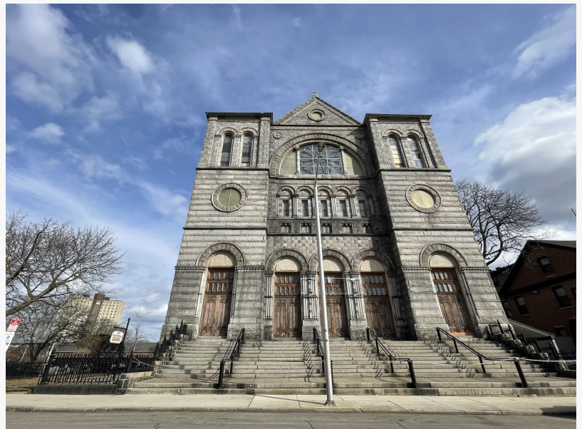
The home of The Jack Kerouac Center

LOWELL, MA, UNITED STATES, May 8, 2025 /EINPresswire.com/ -- Multi-Platinum, GRAMMY-winning artist Zach Bryan has purchased the historic former Saint Jean Baptiste Church building in Lowell, Massachusetts, ensuring its transformation into the previously announced Jack Kerouac Center . The project was initially announced in November 2022, but stalled amid the COVID-19 pandemic and funding issues.