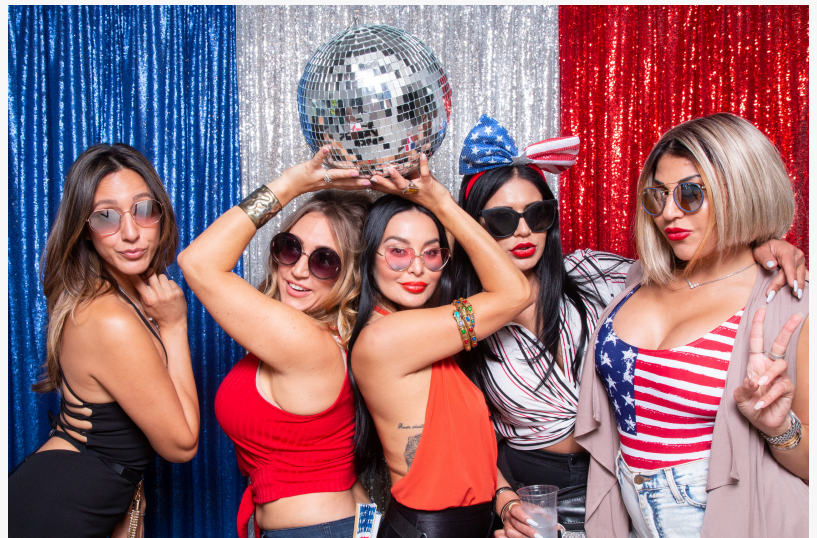
Friends bring the energy at a themed party, captured by Hey!Booth—where vibrant backdrops and bold style turn every photo into a statement.