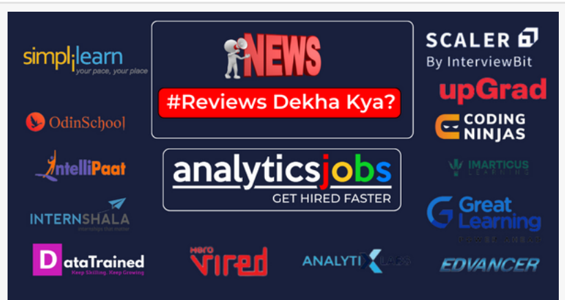
Analytics Jobs - Course Reviews