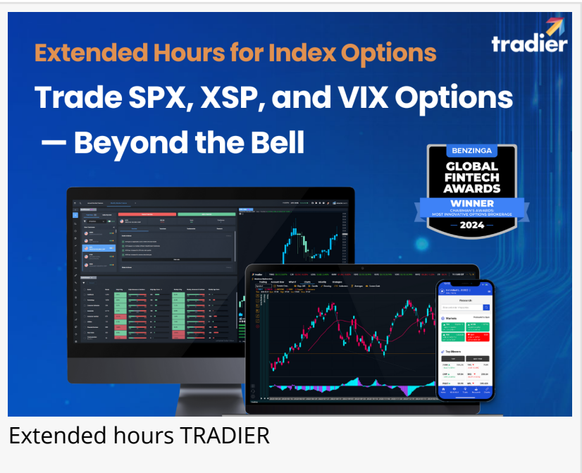
Extended hours TRADIER

CHARLOTTE, NC, UNITED STATES, May 9, 2025 /EINPresswire.com/ -- Tradier, a leading brokerage platform focussed on active options and algorithmic traders, today announced the launch of Extended Hours Trading for SPX , XSP, and VIX options. Available from 8:00 AM to 5:00 PM EST, this new capability is made possible through an expanded partnership with the Chicago Board Options Exchange (Cboe).