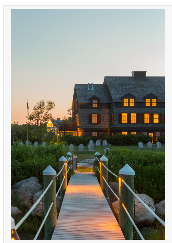
Weekapaug Inn Arrival

Weekapaug Inn Media Contact The Mayfield Group weekapauginn@mayfieldpr.com