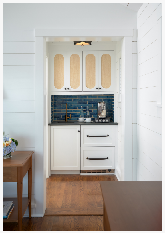
Weekapaug Inn Fenway Suite Wet Bar