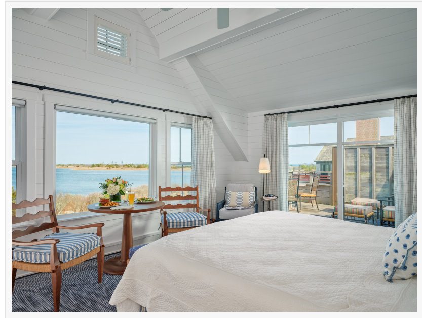
Weekapaug Inn Fenway Suite