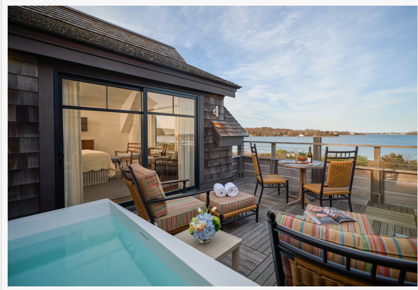
Weekapaug Inn Fenway Suite Deck

ever since to its bucolic landscape where a shimmering sun rises over Quonochontaug Pond, Adirondack chairs grace the great lawn, and a verdant chef's garden provides the Inn's kitchen and bar with the freshest of ingredients. 33 guest rooms, including four Signature Suites, range from 250 to 2,000 square feet. Each is distinctive in décor, and equipped with the finest amenities, as well as a mix of original Inn furnishings and up-to-date pieces.