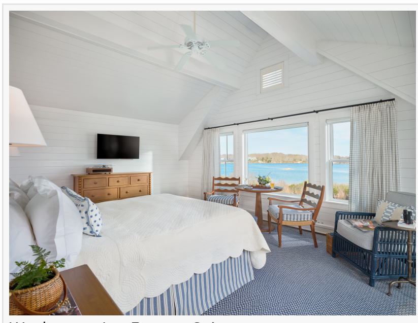
Weekapaug Inn Fenway Suite

WEEKAPAUG, RI, UNITED STATES, May 8, 2025 /EINPresswire.com/ --Weekapaug Inn, a timeless Relais & Chateaux and Forbes Five Star Hotel, New England-style inn set in the peaceful Weekapaug community perched on the idyllic Quonochontaug Pond with sweeping views of the Atlantic beyond, announces the completion of an inspired renovation to its renowned Fenway Suites, blending timeless coastal elegance with modern luxury. Named Fenway, meaning 'Path through a Marsh', these reimagined accommodations represent a new chapter for the beloved seaside retreat, designed to