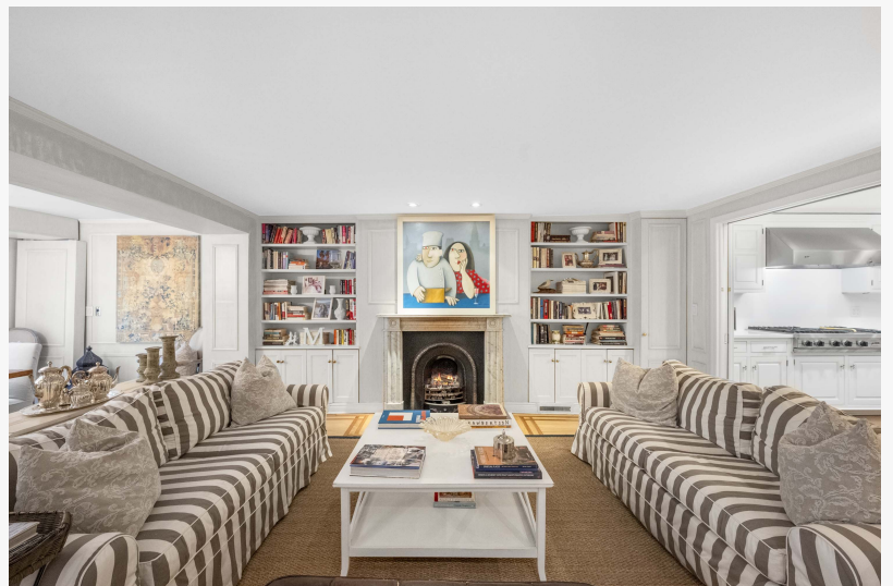
Six Bedrooms and Seven Bathrooms in Prime Turtle Bay Location