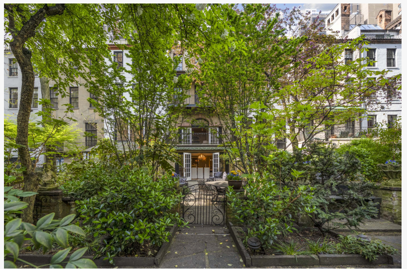
Minutes from World-Class Dining, Culture, and Transportation

Steeped in history and global significance, the Turtle Bay neighborhood rose to international