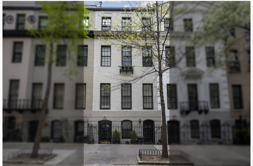
20-Foot-Wide Townhome Offering 5,000 Square Feet of Luxury Living Space