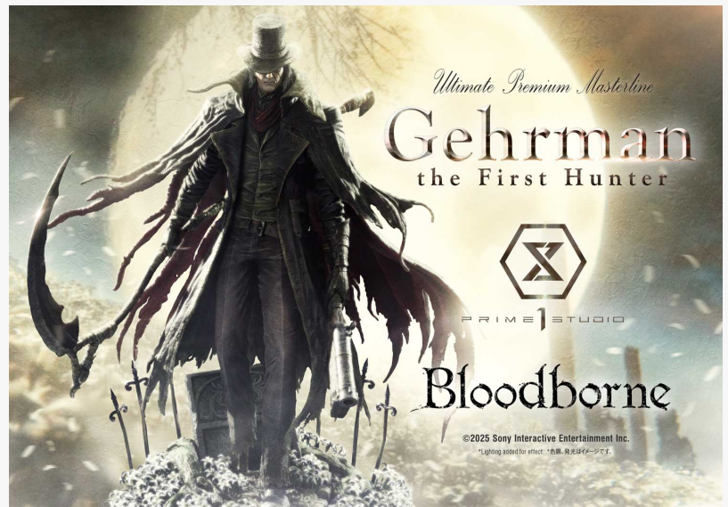
Ultimate Premium Masterline Bloodborne Gehrman