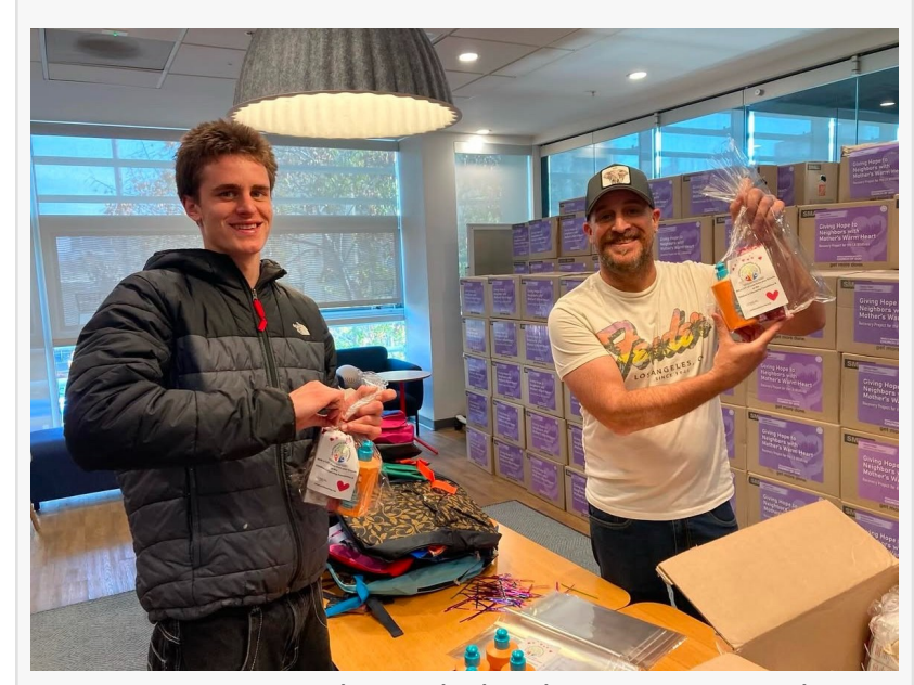
Open Hearts Foundation helped serve as a conduit to care supplies during the fires

ground. This latest round of funding illustrates the Foundation's ability to quickly adapt to urgent community needs, ensuring that the most vulnerable are not left behind.