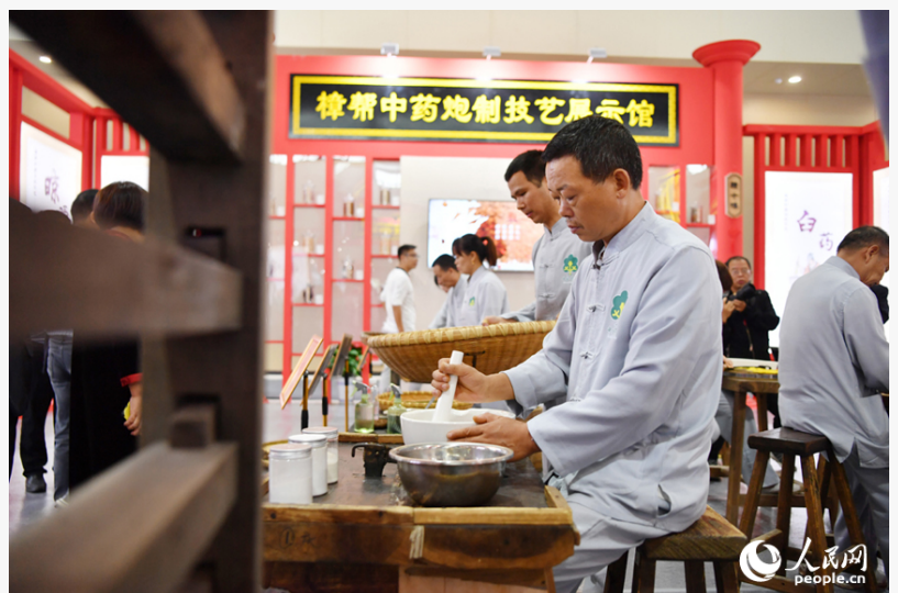
Medical processing in Zhangshu