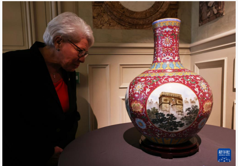
A visitor visited the "Porcelain's Journey along the Silk Road"-Ceramic Culture Special Exhibition of Jingdezhen, at the China Cultural Center in Paris

Jingdezhen, internationally recognized as the "Porcelain Capital of the World," has produced fine ceramics for over a thousand years. The Jingdezhen Imperial Kiln Museum, opened in 2020, is pioneering digital restoration techniques. Using AI algorithms and naked-eye 3D scanning, the museum has