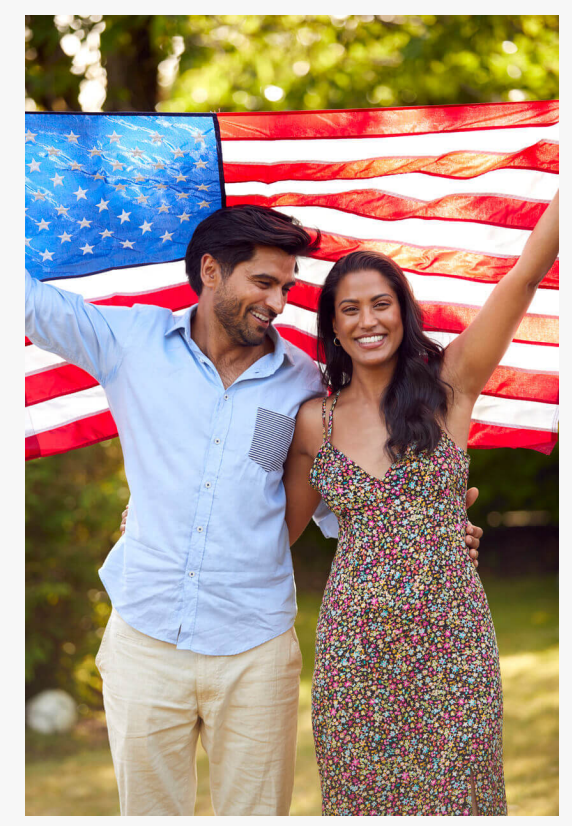
EB5 Green Card, EB5 Regional Center