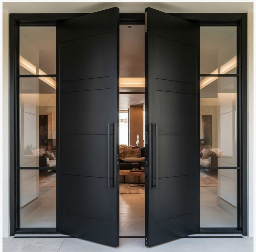
Sleek Double Fire Rated Doors with Sidelites

DALLAS, TX, UNITED STATES, June 11, 2025 /EINPresswire.com/ -- Love That Door , a premier manufacturer and distributor of custom steel doors , windows, and gates, is proud to announce the launch of its new line of fire-rated doors, providing unmatched security, elegance, and long-term performance. Designed to meet the needs of both luxury residential properties and commercial buildings, these advanced fire-rated doors combine high-level functionality with sophisticated design, ensuring maximum safety and aesthetic appeal.