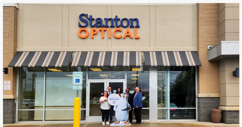
Stanton Optical Niagara Falls Staff Celebrating Grand Opening Ceremony

NIAGARA FALLS, NY, UNITED STATES, May 14, 2025 /EINPresswire.com/ -- Stanton Optical, a leading provider of accessible and affordable eye care, is proud to announce the grand opening of its second New York location , located at 1596 Military Road, Suite 300, Niagara Falls, NY 14304. This expansion reinforces Stanton Optical's dedication to Making Eye Care Easy across our communities.