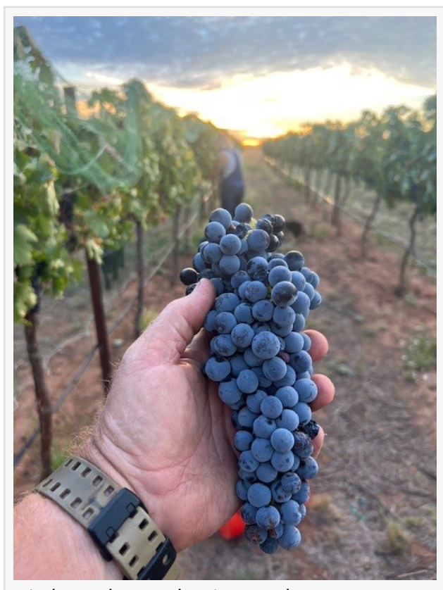
Birds and Barrels Vineyard Grapes

This press release can be viewed online at: https://www.einpresswire.com/article/811112236 EIN Presswire's priority is source transparency. We do not allow opaque clients, and our editors try to be careful about weeding out false and misleading content. As a user, if you see something we have missed, please do bring it to our attention. Your help is welcome. EIN Presswire, Everyone's Internet News Presswire™, tries to define some of the boundaries that are reasonable in today's world. Please see our Editorial Guidelines for more information. © 1995-2025 Newsmatics Inc. All Right Reserved.