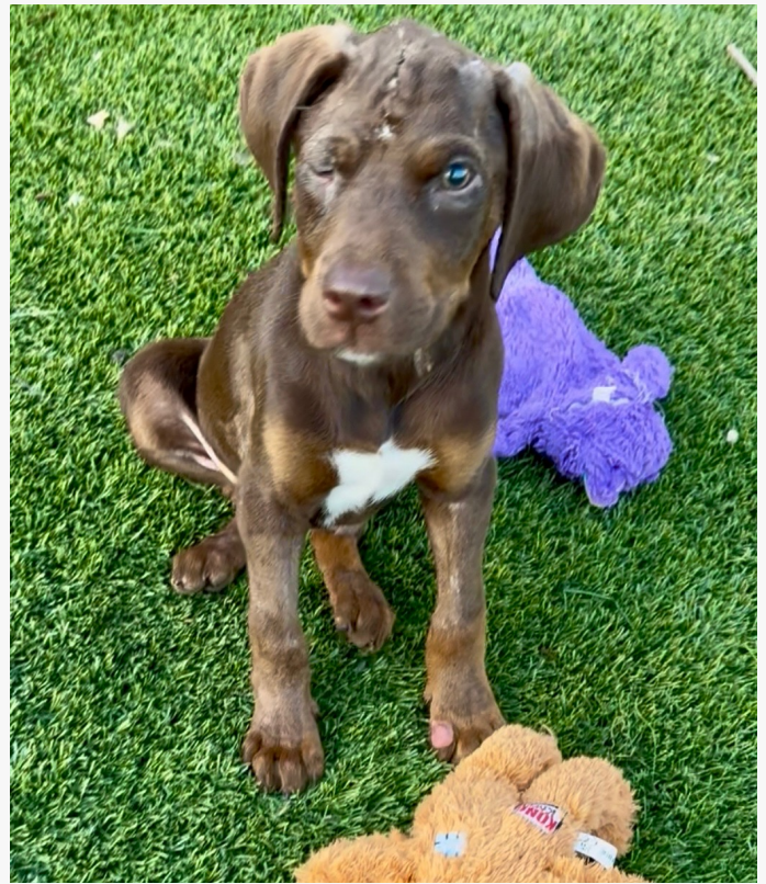
Abused Puppy Recovers After Surgery