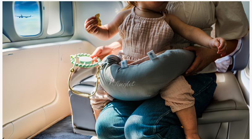
The Winglet Takes Flight

Convention Center in Las Vegas in Las Vegas. Attendees will get an in-person look at The Winglet™ , Unrattled's groundbreaking all-in-one solution designed to make travel with lap infants easier and more comfortable.