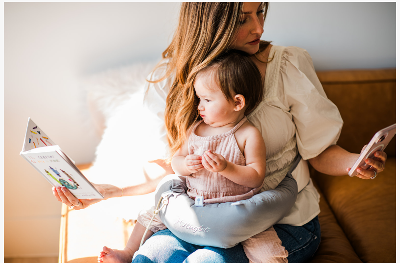
Comfort Meets Freedom