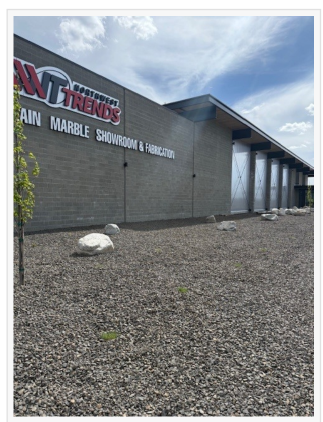
Translucent walls with Crystal Structure's Skyview 40 system enhances the beauty of any showroom

Josh Sucher Crystal Structures +1 316-838-0049 email us here