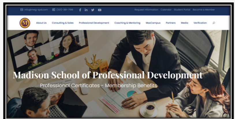
MEG Homepage: https://meg-spd.com

This press release can be viewed online at: https://www.einpresswire.com/article/811401131