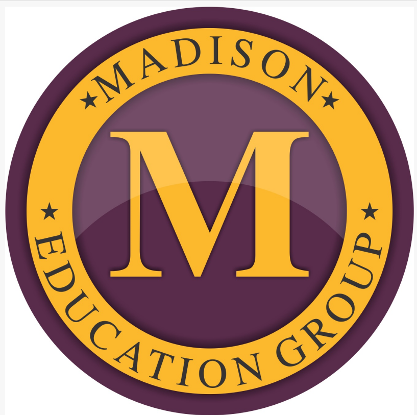
MEG LLC Logo