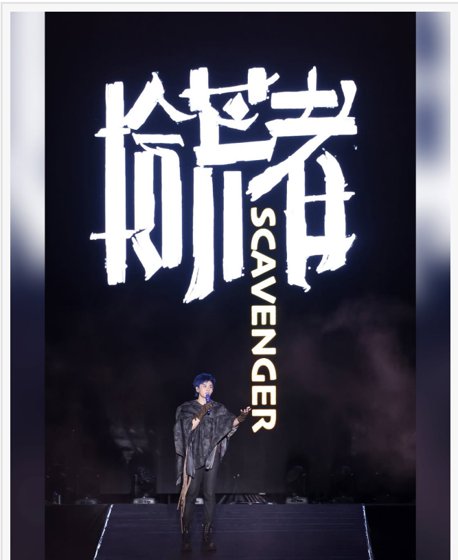
Scavenger Concert Photo 1

The concert's narrative unfolded through three video segments, anchored by the theme of "Interstellar Scavenging." The opening act depicted a spaceship landing on an unknown planet. Zhang appeared in a weathered, post-apocalyptic robe, a patchwork of distressed fabrics and indigo-dyed denim. Lying in the center of the stage, he repeatedly whispered " Can you hear me? ", as if probing for alien life within the desolate landscape.