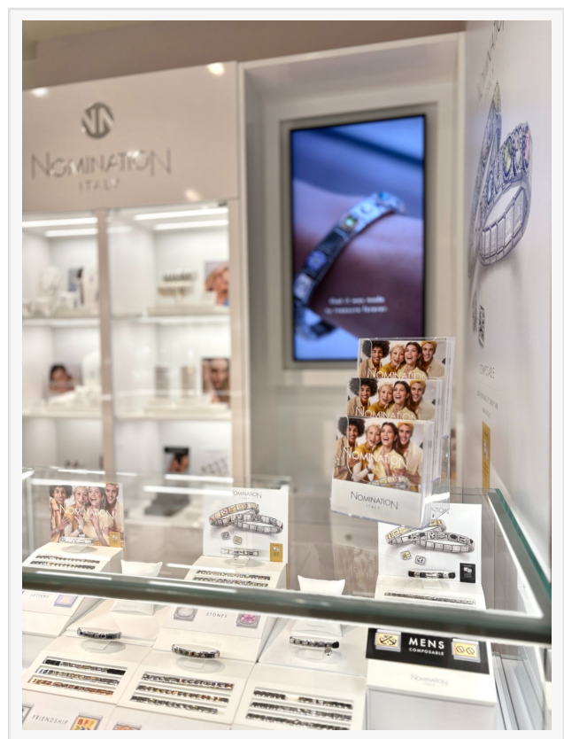
large selection of jewellery