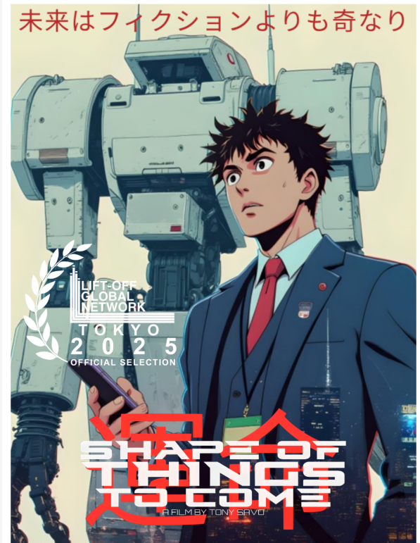
"Shape of Things to Come" Official selection of the 2025 Tokyo Lift-Off Film Festival - Tokyo, Japan.