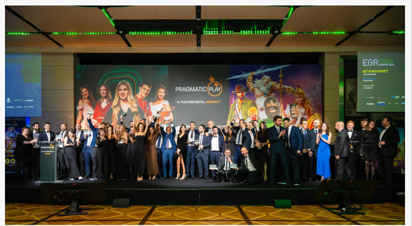
EGR Italy Awards

These achievements highlight the strength of Hub Affiliations' business model and its ability to adapt to market evolution, consistently delivering innovative, cutting-edge affiliate solutions.