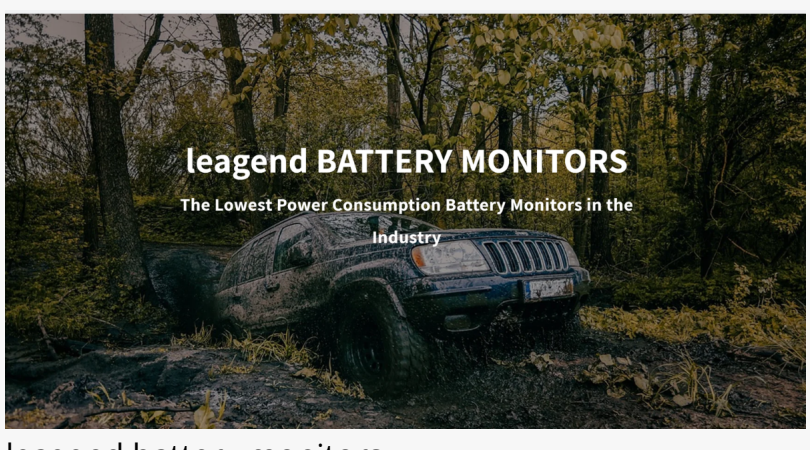
leagend battery monitors

Proactive warning systems are crucial for preventing service interruptions. leagend BM7 continuously monitors voltage, temperature and charge state against user-defined limits, and instantly triggers alarm notifications if any parameter strays beyond safe bounds. Alarm profiles can be configured on a per-device basis, enabling different alert sensitivities for passenger cars, heavy-duty commercial