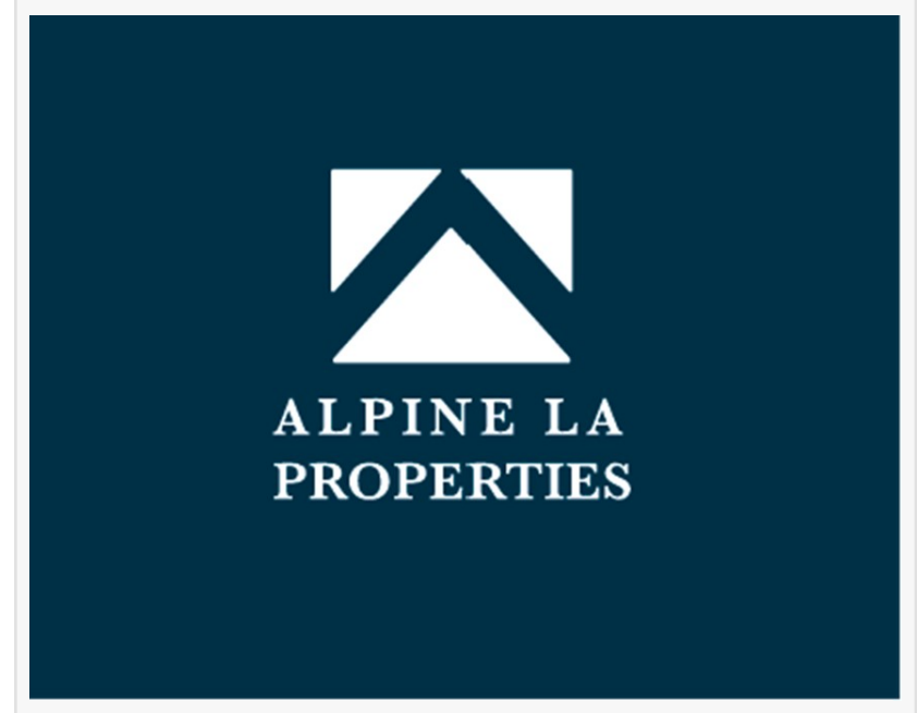
Beautiful, newly remodeled apartments at affordable rates.