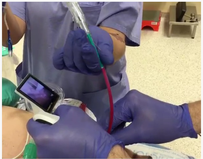
Voir Bougie used with Video Laryngoscope

Just as important is maintaining the bougie position during use which can also avoid accidental esophageal intubation. Medical teams within hospital and prehospital can now use a bougie that takes the guesswork out of their use. Using color coding to improve patient safety is nothing new and having this system on a bougie makes a whole world of sense”