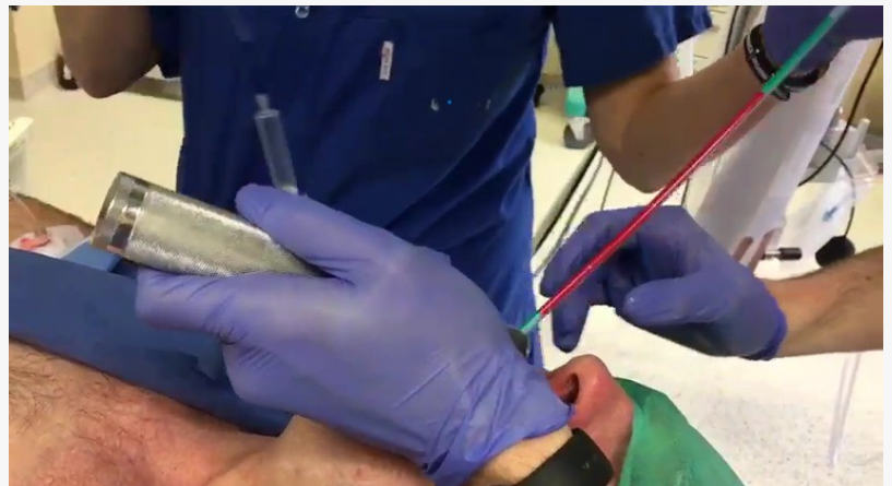
Voir Bougie used with Direct Laryngoscope

For more information on the Voir Bougie® and other Adroit Surgical products in Australia and New Zealand, contact: