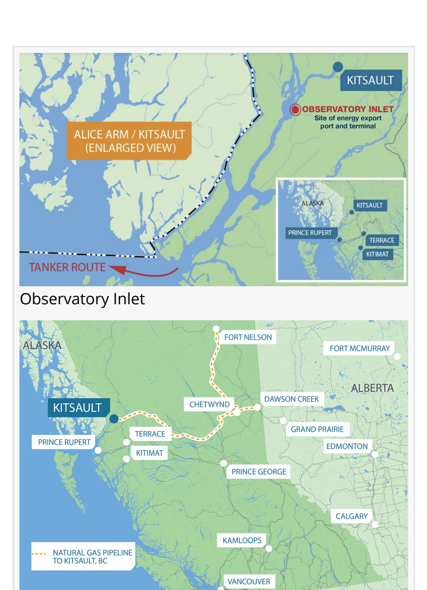
Kitsault Energy Pipeline Route

KE will also use its dedicated export port and terminal at Observatory Inlet to transport energy to Asia. This critical infrastructure will open new markets, bringing billions of dollars in tax revenue to Alberta, British Columbia, and the federal government of Canada, while creating thousands of high-paying jobs. The project is expected to significantly bolster Canadian energy companies, offering new opportunities