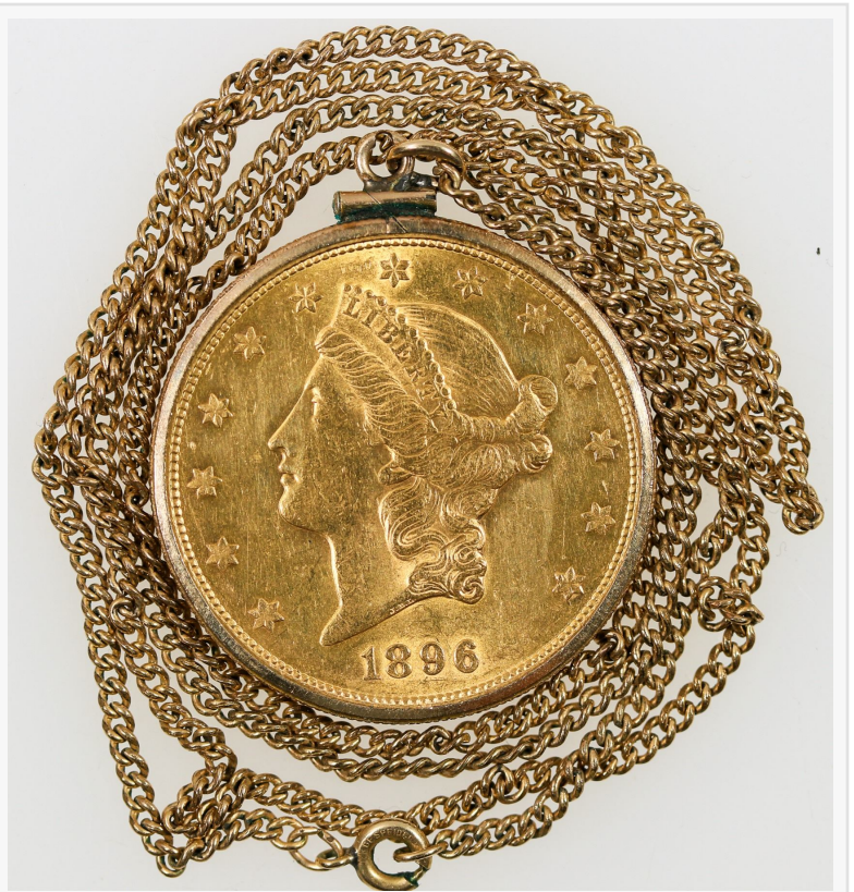
This 26-inch necklace boasting a U.S. Liberty Head 1896-S $20 gold piece in Fine-Extra Fine condition, in bezel, topped out at $3,625.

This press release can be viewed online at: https://www.einpresswire.com/article/811880837