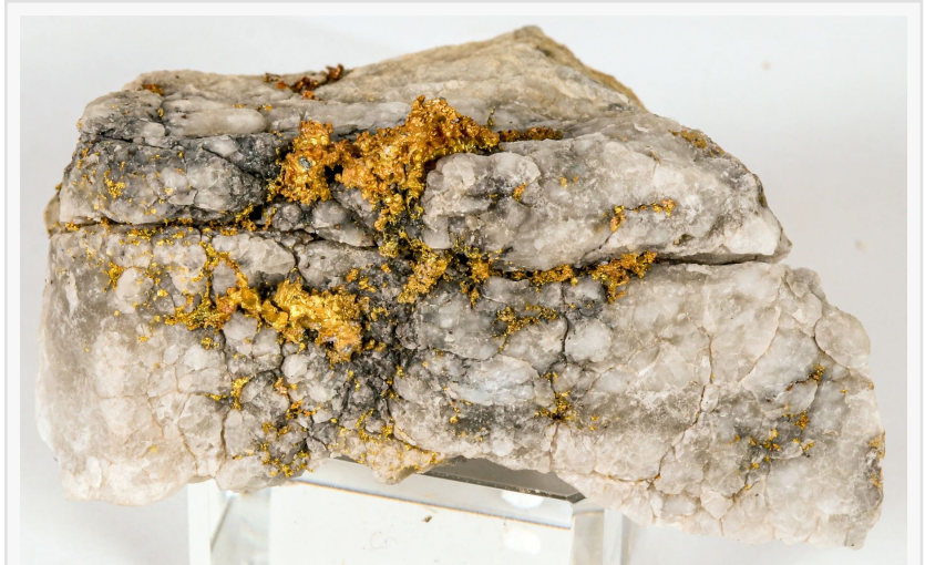
Native crystalline gold in quartz specimen from Timmins, Ontario – Canada's richest gold region, the city having been founded in 1911 – containing 26.8 grams of gold. ($3,000).

RENO, NV, UNITED STATES, May 12, 2025 /EINPresswire.com/ -- Holabird Western Americana Collections, LLC officially ushered in the month of May with a four-day "Mint State" Americana & Numismatics Auction held May 2nd thru May 5th. The first three days were live sessions, held online and live in the Reno gallery. May 5th was a timed-only session; bids could be placed online, in-person or over the phone with an agent.