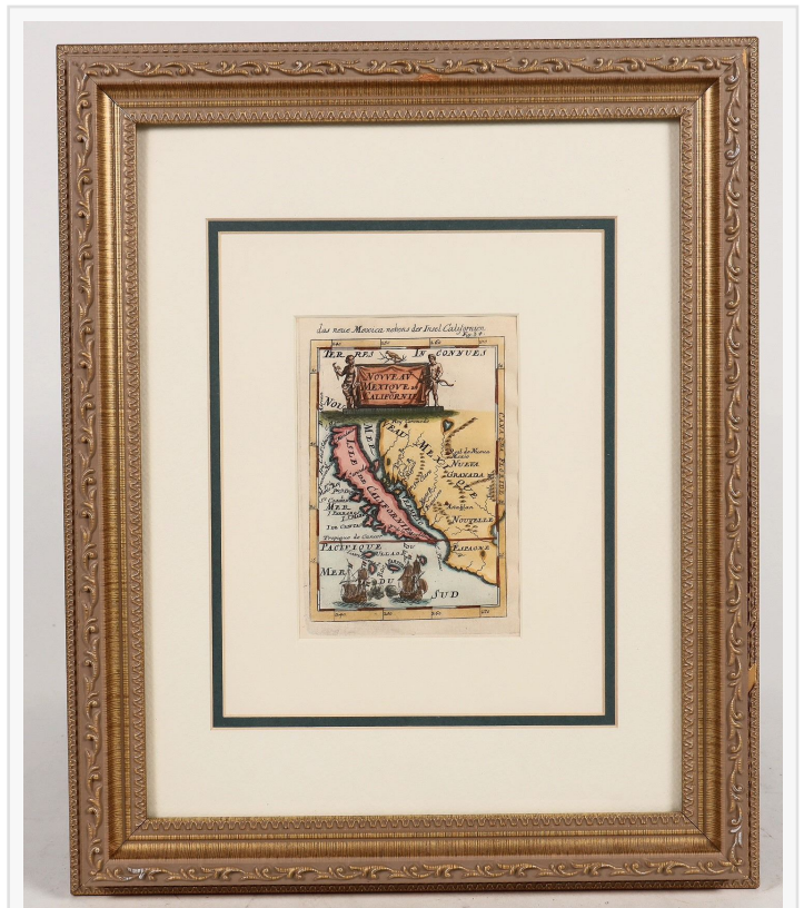
Small color map rendered circa 1685 showing California as an island, an original copper engraving with later hand-coloring from AM Mallett, 6 ½ inches by 4 ½ inches ($3,000).

Day 2, on May 3rd, featured 542 lots of Native Americana; cowboy collectibles; militaria, weaponry and political items; minerals (including fossils and gold specimens); mining (including