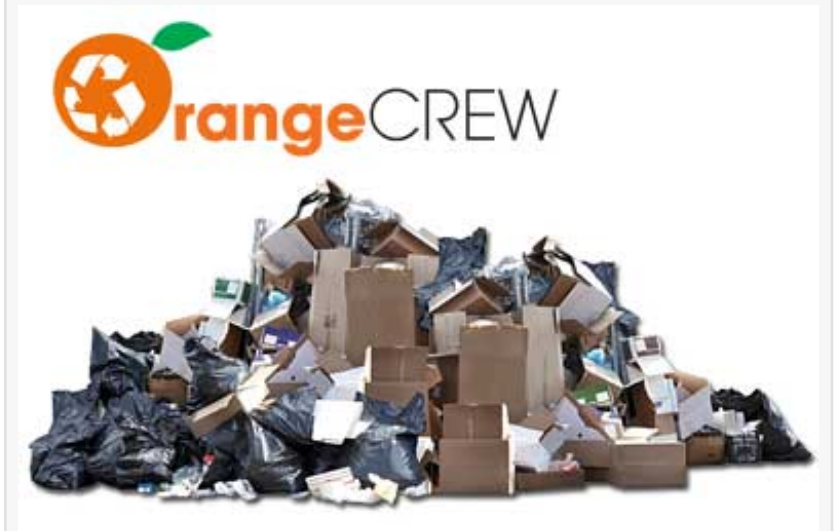
get rid of your junk

implemented updated training protocols to ensure safe handling of these items, including refrigerant recovery and e-waste sorting where applicable.