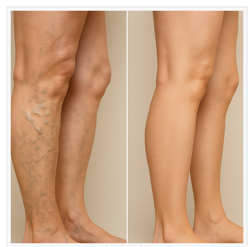
Venous Treatment Before & After

As part of this major outreach effort, ECCO Medical has launched a full Spanish-language education campaign, producing culturally relevant radio and TV commercials specifically designed for Hispanic audiences in the Denver and Pueblo markets. These commercials emphasize ECCO's commitment to helping women understand their options for vein and