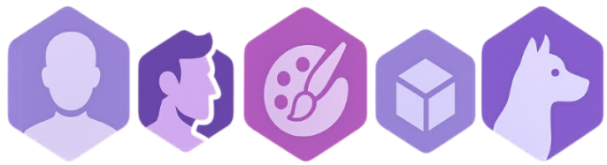
Five specialized training pipelines

RunDiffusion is an AI creative suite purpose-built for professional designers, offering a unified platform for creators, professionals, and teams. The company provides intuitive workflows that maintain creator ownership while delivering high-quality results at 10X the speed of traditional methods. Creative teams from industry-leading companies and studios rely on RunDiffusion's integrated tools to ensure consistent, professional results across projects of all sizes. For more information about RunDiffusion's training models and platform, visit RunDiffusion.com .