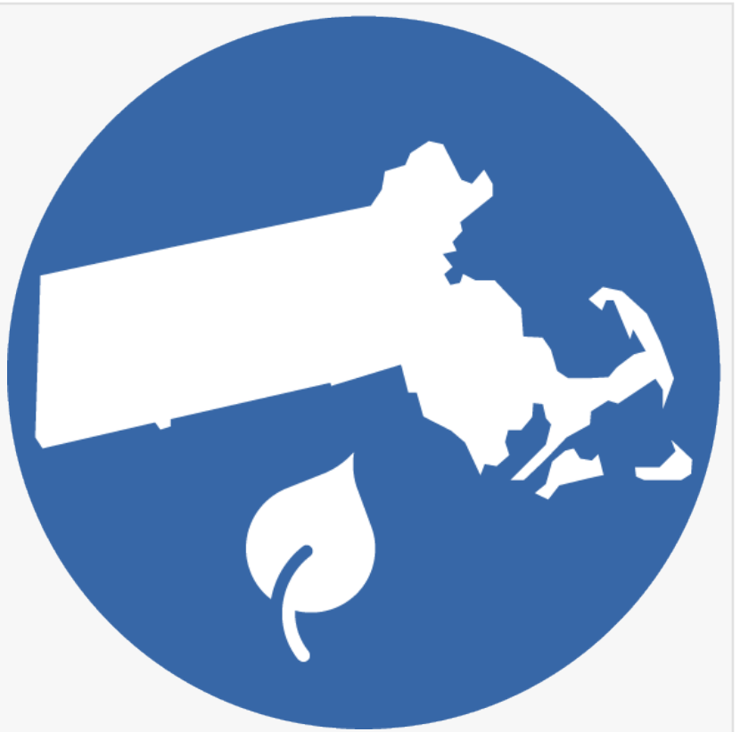
The state of Massachusetts

Massachusetts ranks among the top states for solar adoption, offering homeowners attractive programs like SMART (Solar Massachusetts Renewable Target) and net metering. With Suncovia's