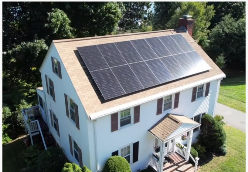
Suncovia Massachusetts Installation