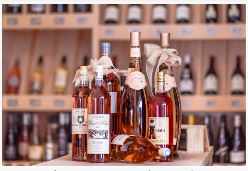
Rose Wine for Summer Times

Wainscott Main is also a hub for the curious drinker. Regular weekend tastings, seasonal Wednesday wine workshops, and producer-led masterclasses bring the stories behind the bottles to life. Whether for a