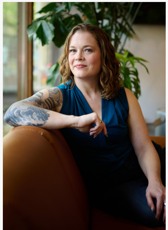
Author Sara Lobkovich.

"You Are A Strategist" is available now in hardcover ($36.95), paperback ($26.95), and ebook ($16.99) formats through all major bookstores. Lobkovich is encouraging readers to support