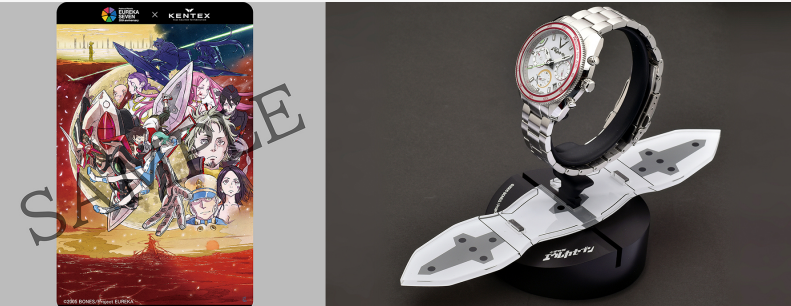
20th anniversary commemorative warranty card and a lifter board-shaped watch stand.

A premium timepiece inspired by the Nirvash type ZERO, limited to just 300 pieces worldwide.