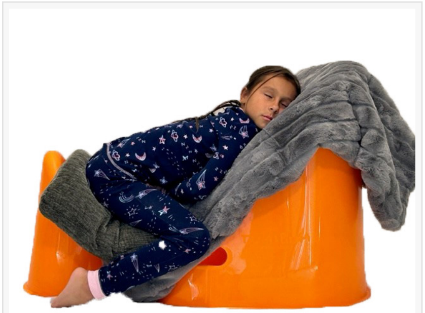
Young child using Tum&Bum incline sleep chair to fall asleep while she is congested and sick.