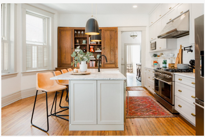
Managed Renovations Kitchen Remodel (2)

Baltimore row house is its slender width. Some homes span just 12 to 14 feet across, making space planning both a challenge and an opportunity. Renovation efforts often begin by reevaluating the flow of the home—looking for ways to reduce visual clutter, remove unnecessary partitions, and create a sense of openness.