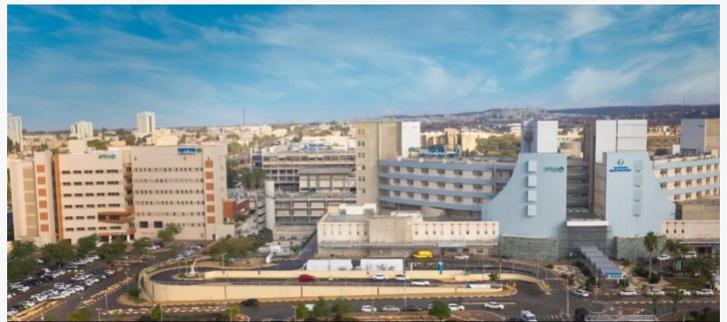
Soroka Medical Center, Israel's Medical Iron Dome