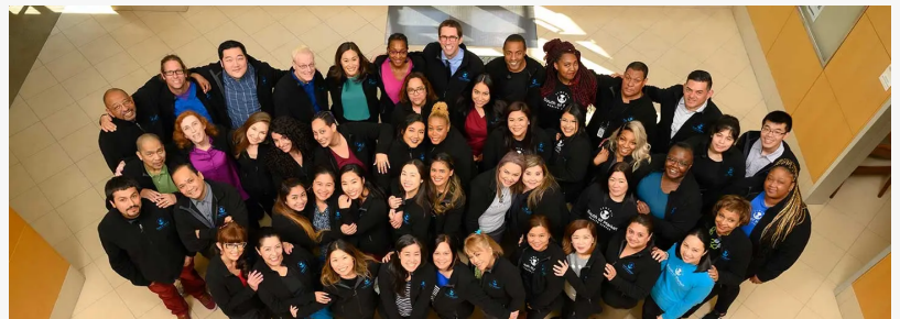
Equity Health Team