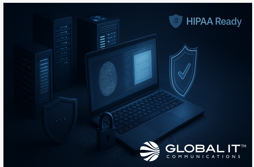
MSP CSP Cybersecurity HIPPA-Compliant FQHC