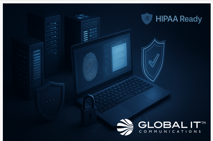
MSP CSP Cybersecurity HIPPA-Compliant FQHC