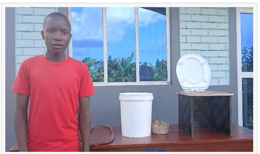
Students from Uganda's Kinoni Integrated Secondary School pose in front of their compost toilet project.

BOSTON, MA, UNITED STATES, May 13, 2025 /EINPresswire.com/ -- Students from 17 schools across 10 countries recently concluded the second phase of a year-long virtual exchange and civic engagement program organized by <u>United Planet</u>, a nonprofit dedicated to fostering international service learning and youth leadership under the <u>Unite All Schools</u> Initiative.