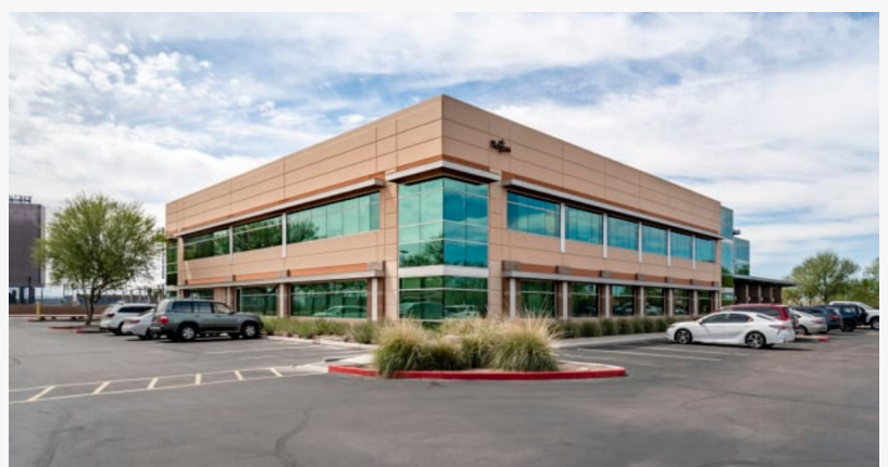
The Valley Law Group's Peoria office has become a trusted legal resource in the Northwest Valley since opening in 2024.

https://thevalleylawgroup.com/about-us/peoria-location/