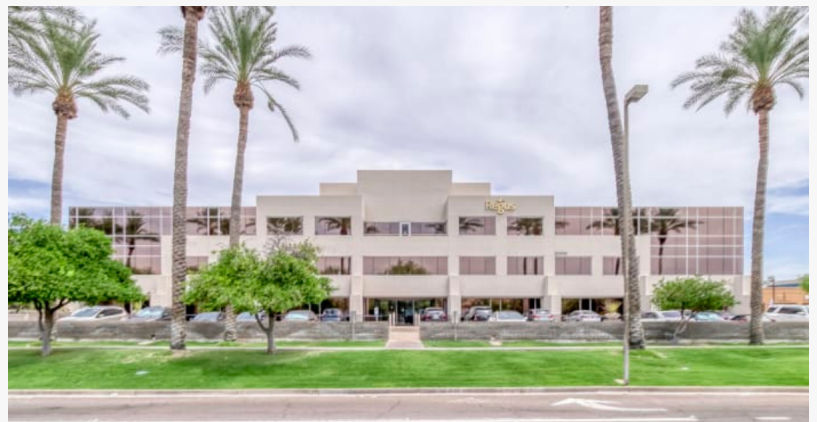
The Scottsdale location of The Valley Law Group continues to serve the Northeast Valley with client-first legal counsel.