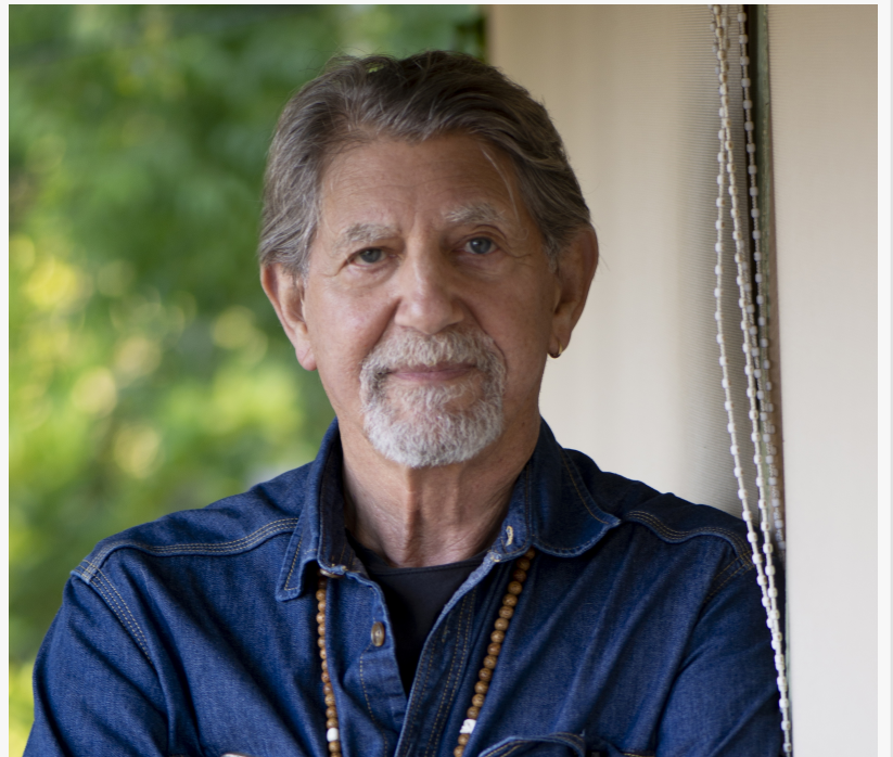
Actor, director, and author Peter Coyote

They reflect Osmosis' enduring commitment to creating space for rejuvenation, clarity, and reconnection.