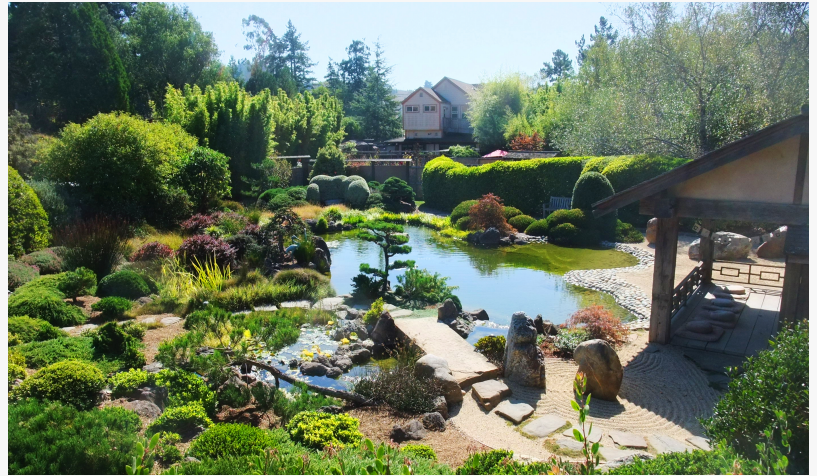
Zen gardens at Osmosis Day Spa Sanctuary

reflections from his transformative new book, Carbon, The Book of Life in dialogue with the legendary Peter Coyote — celebrated actor, director, and author. A lifelong activist and ordained Zen priest, Coyote brings a rare depth and resonance to every dialogue, enhanced by his unmistakable voice and profound commitment to planetary healing. Carbon takes us into the world of the most misunderstood yet versatile element on the planet. This stirring, hopeful, and deeply humane book illuminates the infinite connections between carbon and human well-being.