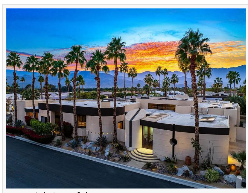
An aerial view of the estate at sunset.

This once-in-a-generation sale features an extensive array of treasures, including works by iconic artists Pablo Picasso and Frank Stella, whose groundbreaking contributions shaped modern and contemporary art. The collection reflects the owner's discerning eye, with pieces spanning paintings, bronzes, and sculptures, alongside exquisite exterior art sculptures that elevate outdoor spaces. Complementing the art are luxury