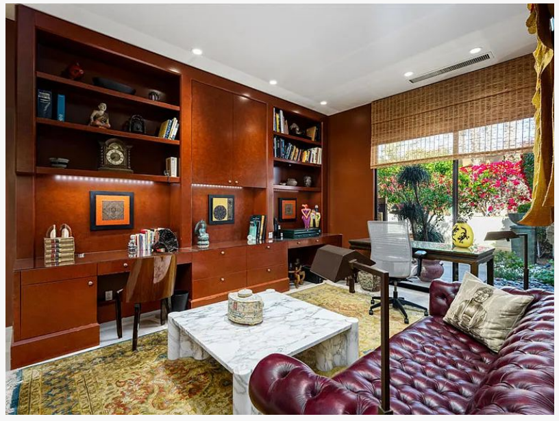
A tasetfully furnished space in the estate, featuring many available pieces.