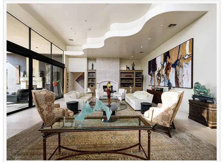
Visual sample of the artistic decor, showcasing fine art and glass sculptures.

Curated over decades by a well-known figure in the Coachella Valley's cultural community, the collection represents a legacy of passion, patronage, and support for the arts. Ties to regional institutions, including the Palm Springs Art Museum, further reflect the collector's longstanding