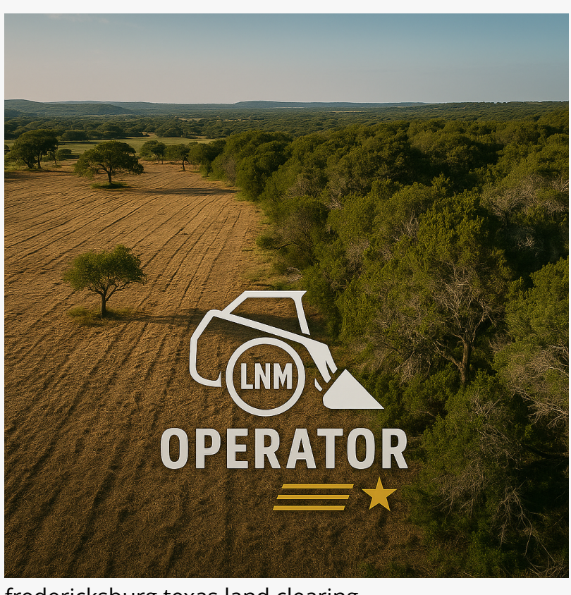
fredericksburg texas land clearing

Pre-Fire Land Clearing & Fire Mitigation Services