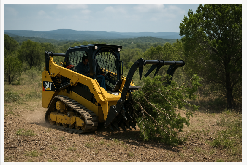
Fredericksburg texas brush removal land clearing