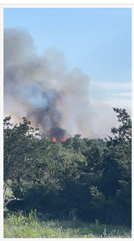
Fredericksburg Texas fire 2025

This marks a troubling recurrence of extreme fire behavior similar to the Crabapple Fire earlier this year, which burned over 400 acres. Persistent drought, unseasonal winds, and high fuel loads have created conditions ripe for rapid fire spread, especially in unmaintained rural areas with dense brush and dry undergrowth.