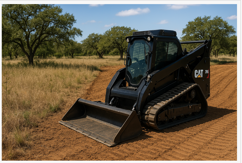
the best Fredericksburg Texas land clearing company